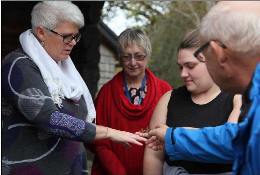
Sharing the wētā with EIT staff and students at the EIT and AirnzET MOU celebration.