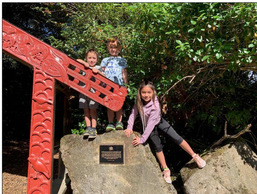
Tamariki/kids enjoying the plaque unveiling as part of one of the Hikoī.