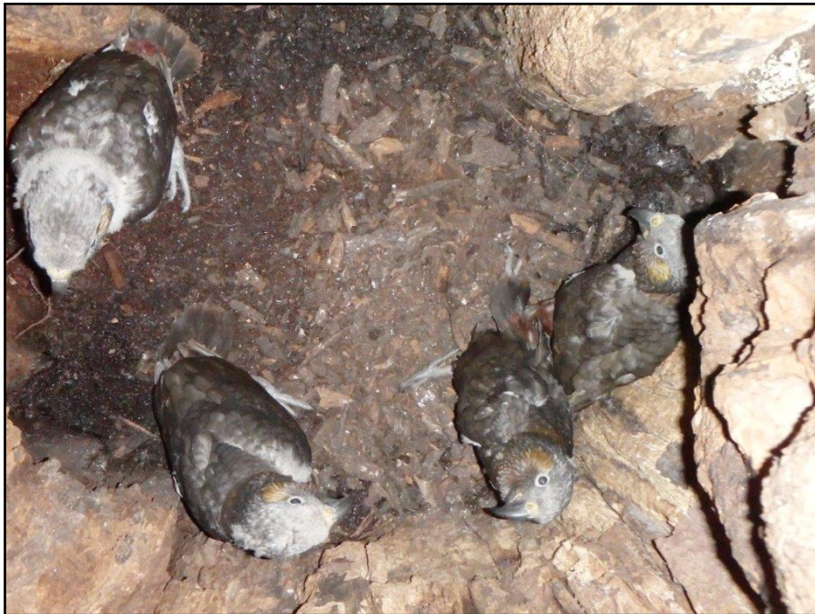
The 4 kākā chicks from progeny of birds initially released under Poutiri Ao ō Tāne.