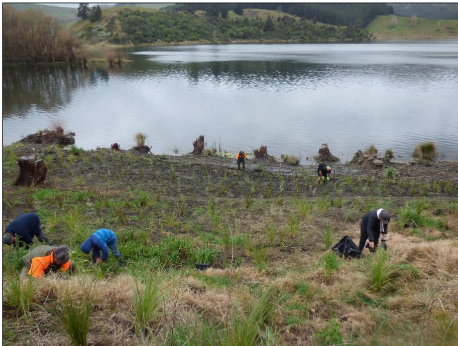
Planting at Lake Tūtira.