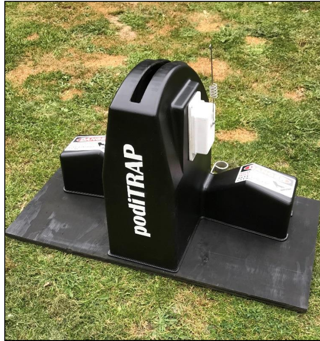
Mustelid podiTRAP with wireless node.