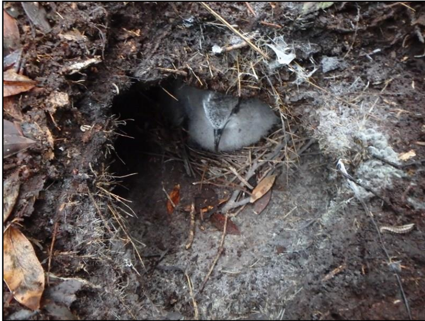
A kōrure chick in its burrow on Whenua Hou/Codfish Is.