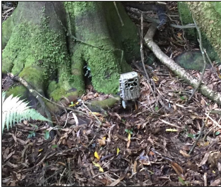
A motion sensitive camera used for monitoring predators.