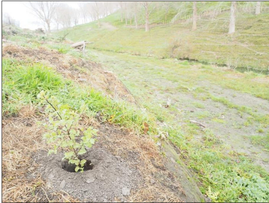
Planting at the Maraetotara River.