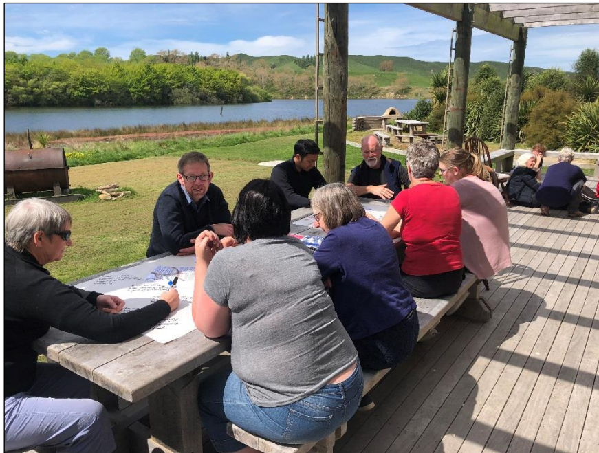
Connected to Nature workshop participants at Mangarara – The Family Farm .