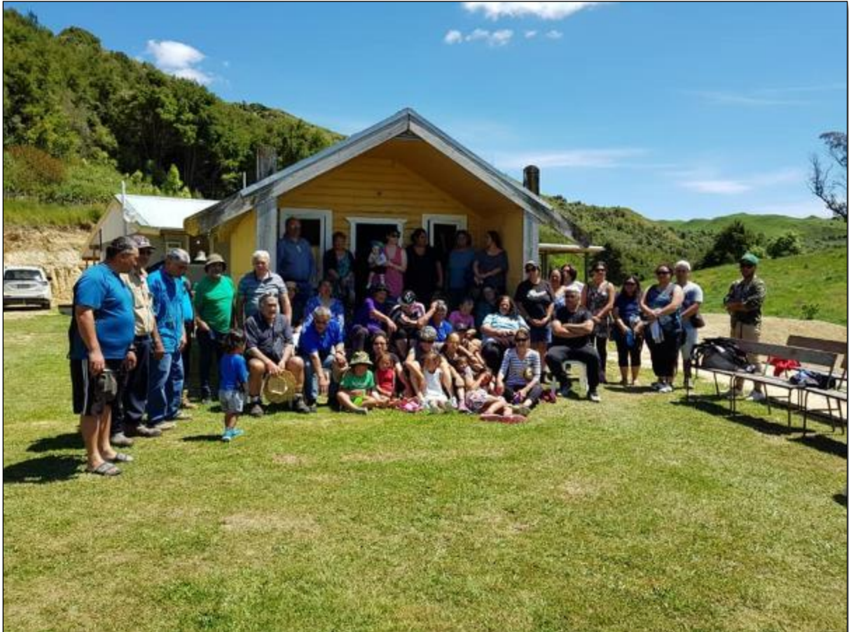
Hikoi Tutuki at Putere Marae

Ngā mihi nui to the Poutiri Ao ō Tāne project for its support of the Hikoi Tutuki which was organised by NPDT and the Kai Oranga wananga participants. The Hikoi Tutuki series is hikoi by iwi of Hawke's Bay who whakapapa in to the Poutiri Ao ō Tāne project including Ngāti Hineuru, Maungaharuru Tangitū and Ngāti Pāhauwera to share cultural and environmental learnings. The Pāhauwera hikoi was attended by over 40 people who visited the Putere Marae, Putere Lakes, Rawhiti Station and Mohaka Marae listening to historical, cultural, environmental and community korero. It was a fabulous day that will be remembered by all.