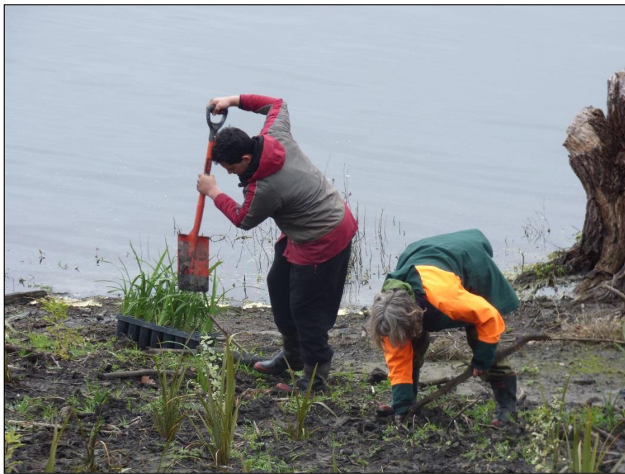
Planting at the Lake Tutira, as part of the Hikoi Tutuki programme.