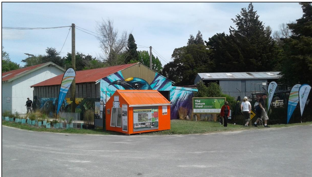
The Nature Shed - Ko Tū koe, ko Rongo koe at the Hawke's Bay A&P show