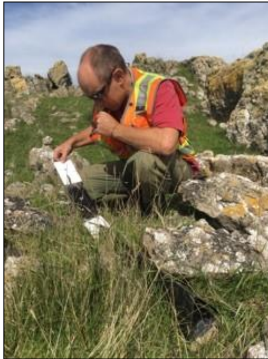
Invertebrate monitoring in Cape to City.