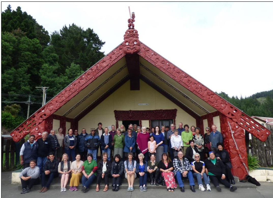
Participants of the Poutiri Ao o Tāne translocation celebration at Tangoio Marae.

Native species thrive where we live, work and play