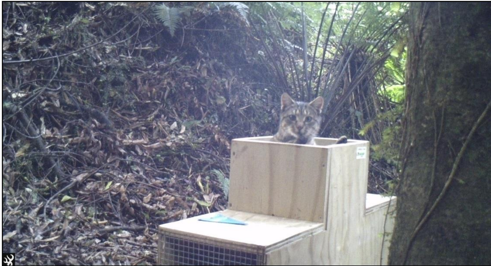
Feral cat in chimney trap as part of recent PAPP trial.