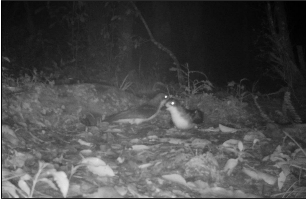
Waitangi, the returned tītī and friend. Photo: motion sensitive camera